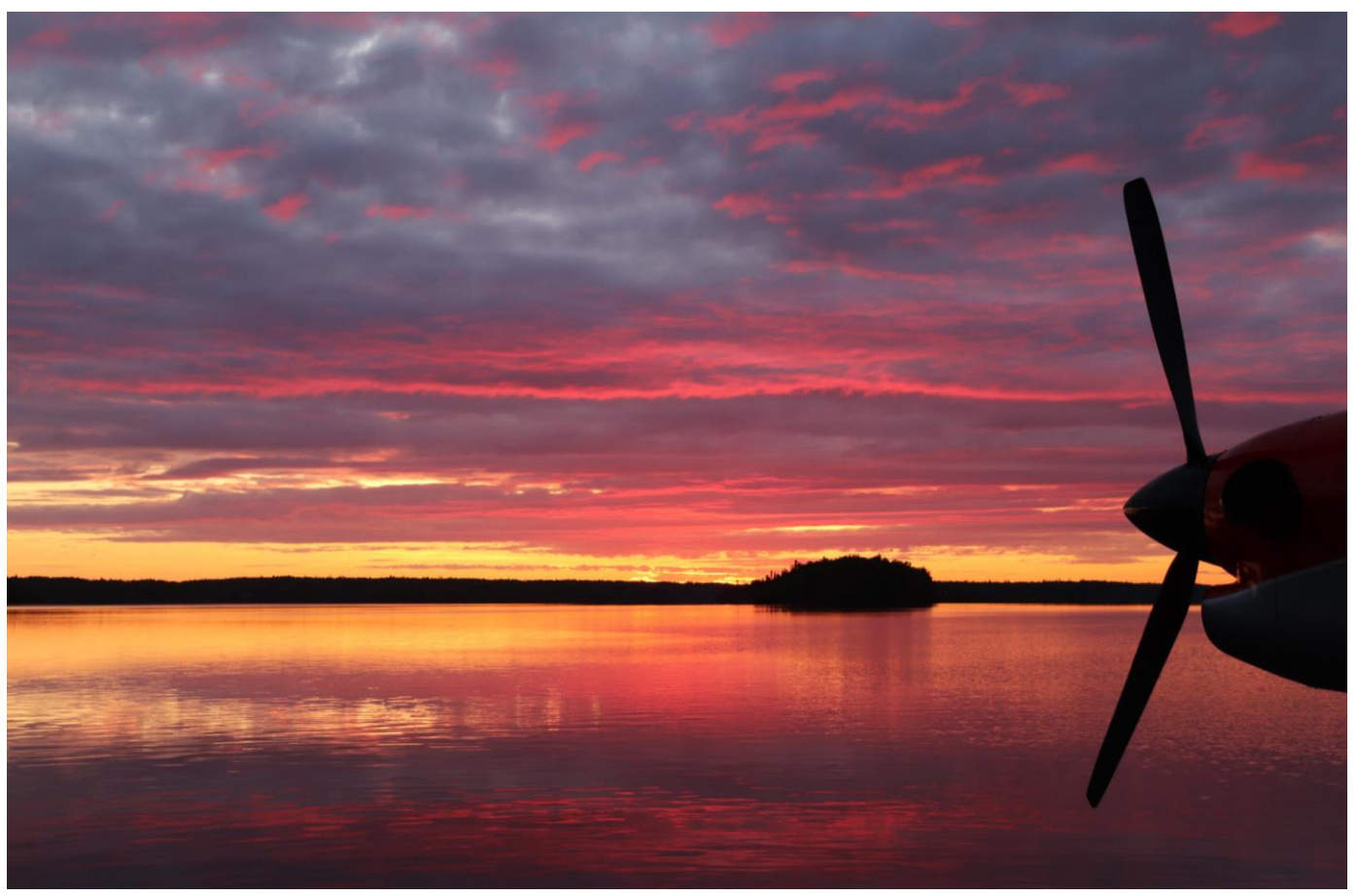
Dawn breaks for some excited fishermen. This taken at the Superior Airways water base in Red Lake.