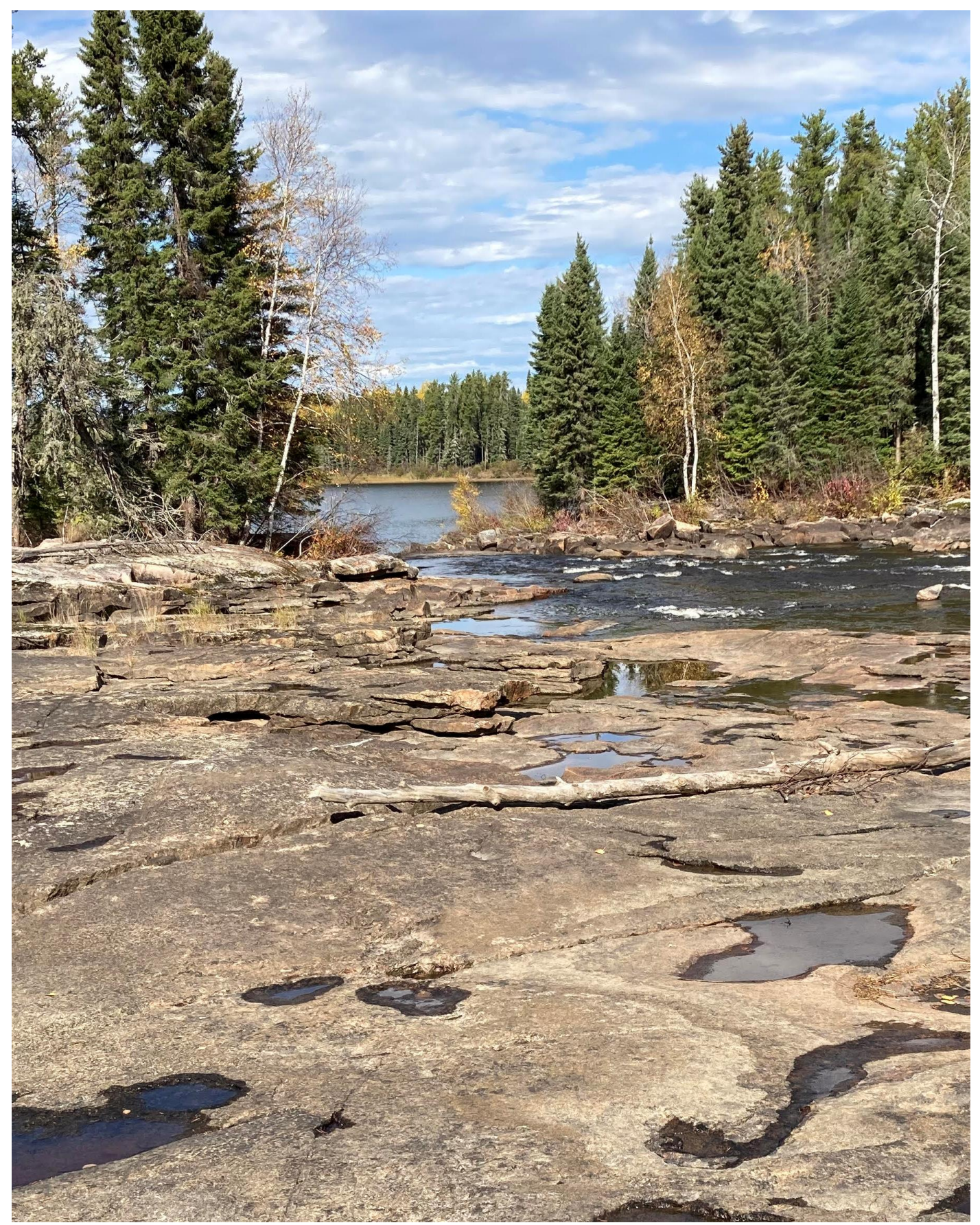
Whitedog Falls taken from the top in September. Not much water cascading over this year.