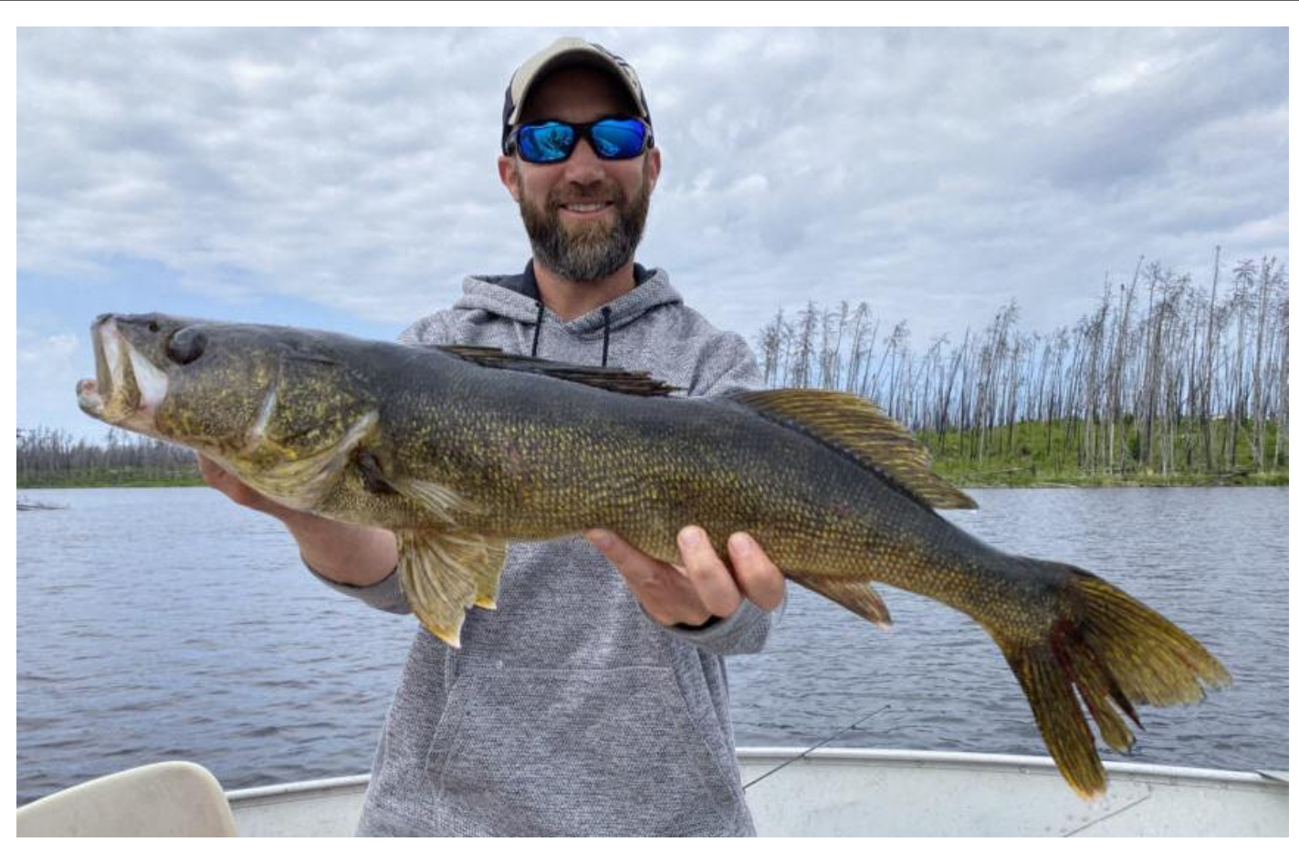
Yet another nice walleye to enter on the board for the Hager group.