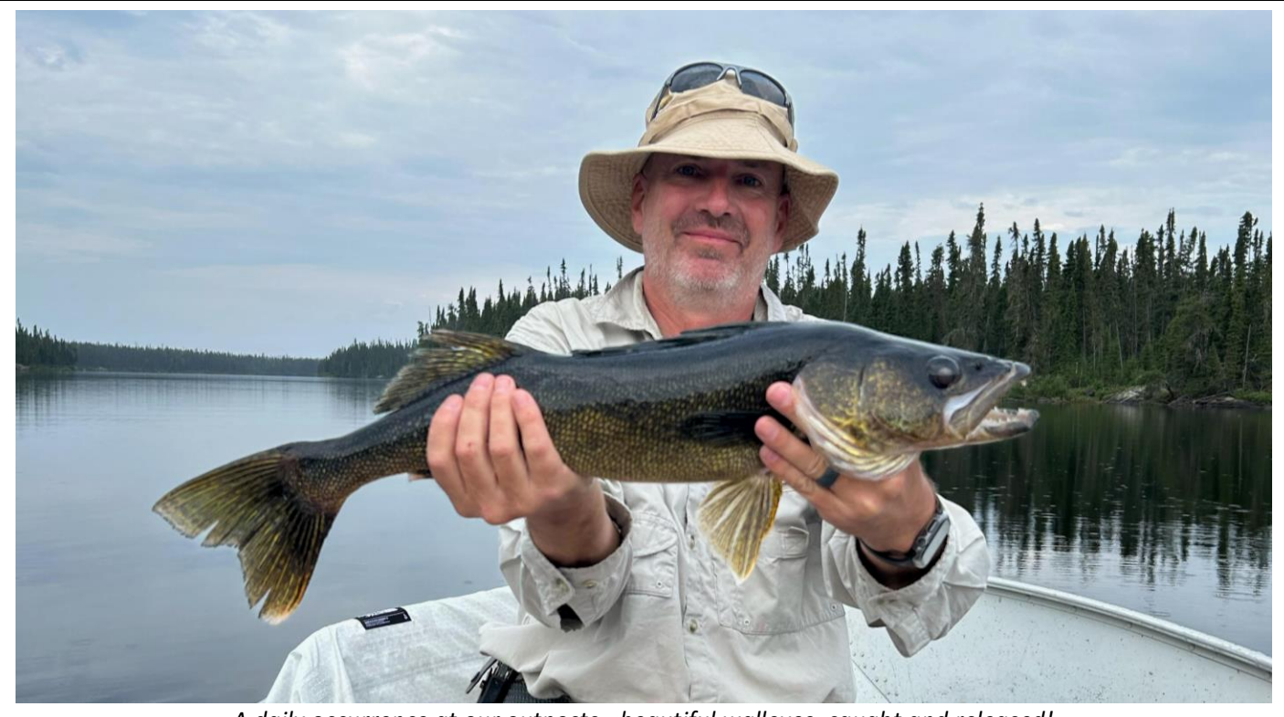
A daily occurrence at our outposts - beautiful walleyes, caught and released!