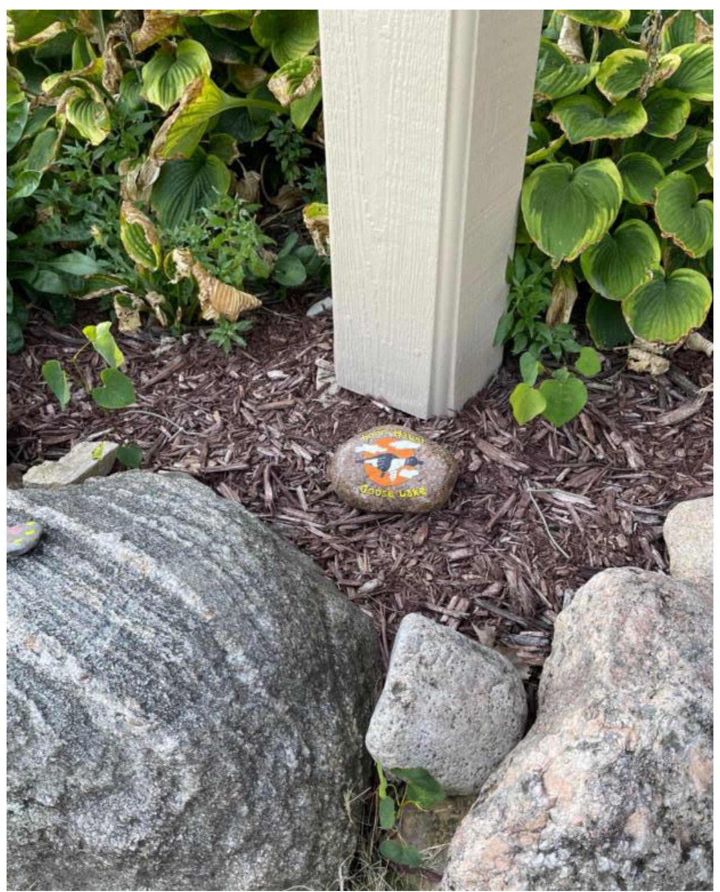
Hiding in Ron S's Iowa flower garden - a reminder of happy times spent with family and friends at Goose Lake.